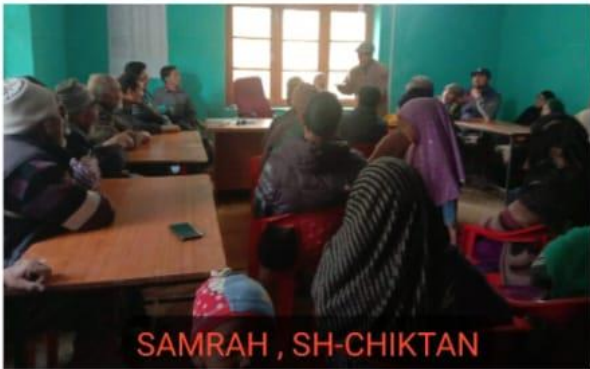
SAMRAH , SH-CHIKTAN